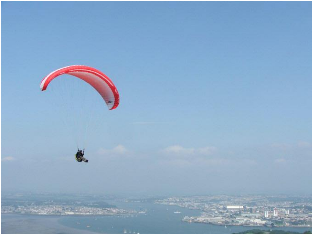
Views up the Tamar past the dockyard (and some paraglider getting in the way).